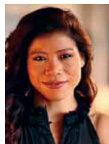
BOXER MARY KOM