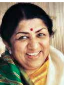
SINGER LATA MANGESHKAR