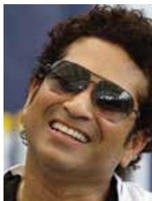
CRICKETER SACHIN TENDULKAR