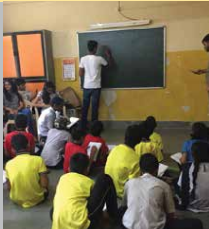
Knowledge multiplied for Bhavishya Yaan kids