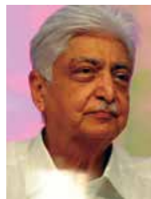
INDUSTRIALIST AZIM PREMJI