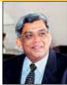
HON. RTN. DEEPAK PAREKH