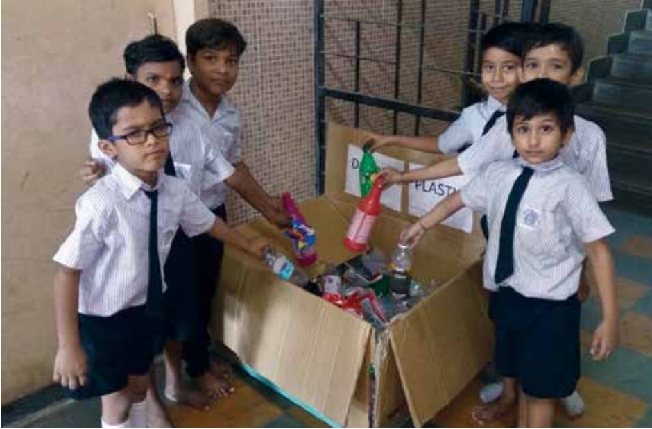
Bhavishya Yaan whole-heartedly supported the drive to get rid of plastic