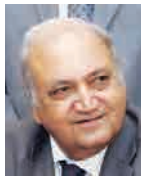
HON. RTN. KESHUB MAHINDRA