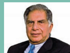
Ratan N. Tata