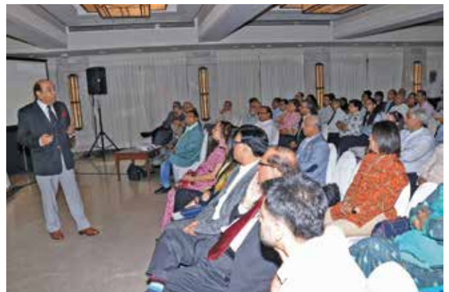
Lt Gen Ata Hasnain keeps Rotarians captivated