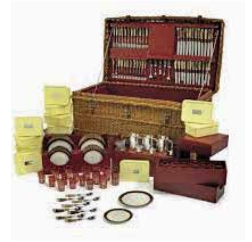
An English wicker picnic hamper, retailed by Asprey & Company, circa 1986. Sold for $212,500 on 10 May 2018 at Christie's in New York