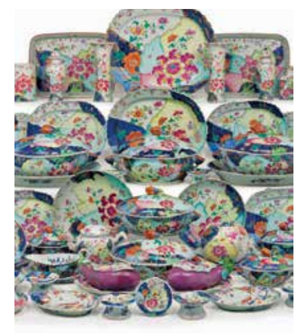
A large Chinese Export 'tobacco leaf' assembled dinner service, Qianlong period, circa 1775. Sold for $1,152,500 on 9 May 2018 at Christie's in New York — a new auction record for a dinner service