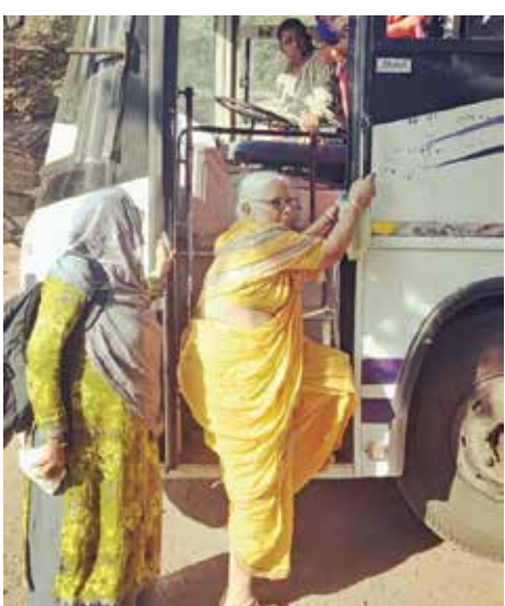
organised by the donor at Jalaram Ram Ashram. On way the back, the group