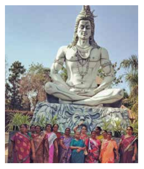
stopped at Prati Shirdi Sai Baba Mandir Sai Dham to pay homage to the deity.

They ended the picnic with snacks and evening tea on their way back.