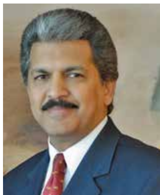
Guest speaker Anand Mahindra, Chairman of Mahindra Group