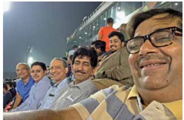
Culture, sports and world-class heritage, Odisha has everything to offer and more

en route, carved during the second century BCE, after stopping at a village with traditional textiles as its main occupation. After lunch, we went to Dhauli hills, where the Kalinga War is said to have taken place in 262 BCE.