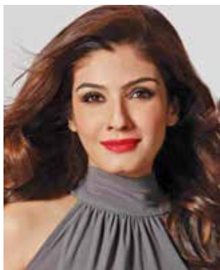
Guest speaker Raveena Tandon, actress