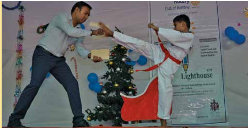
Taekwondo instructor gives a martial arts demonstration