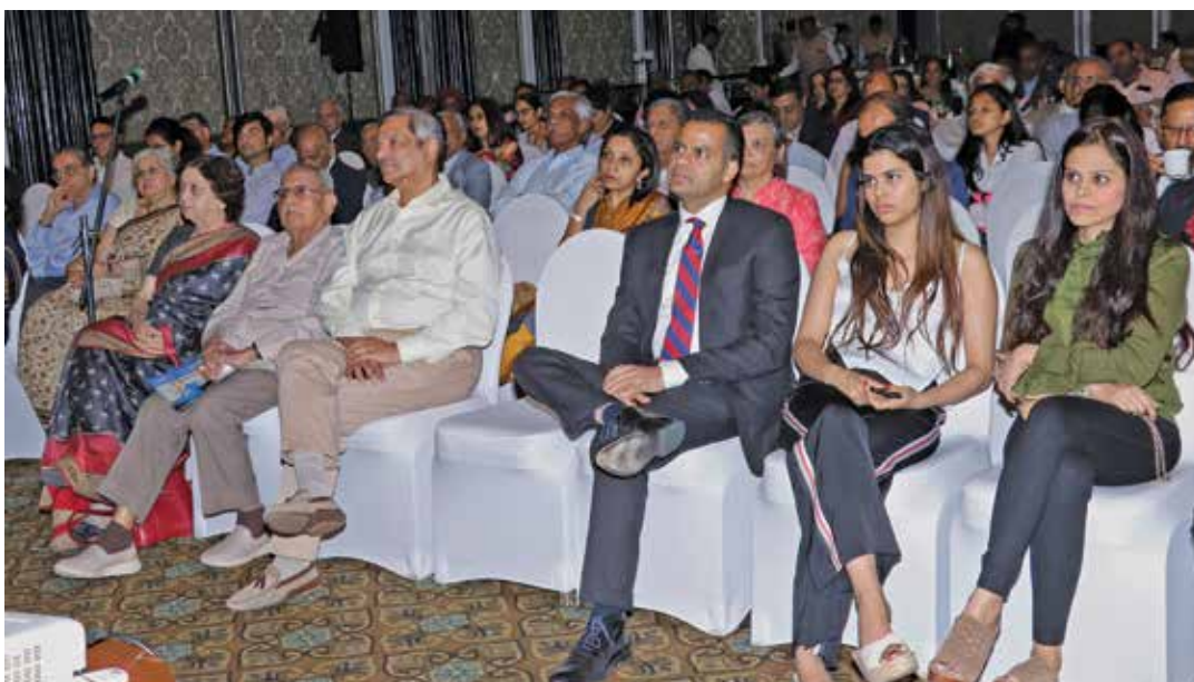
(Below) Rotarians lend a listening ear