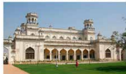
Chowmahalla Palace, Hyderabad

A visual talk - photographs from the court of the Asafjah dynasty with insights into the city, palaces and lifestyle of the Nizams of Hyderabad