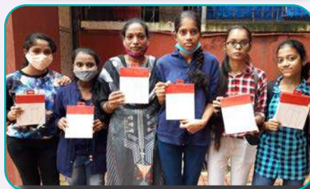
COLABA SCHOOL TOPPERS