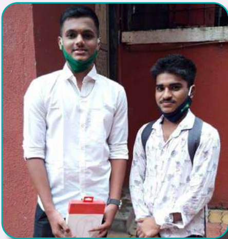
G K MARG SCHOOL TOPPERS

WATCH BHAVISHYA YAAN'S INDEPENDENCE DAY PRESENTATIONS HERE