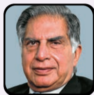
December 28 Hon. Rtn. Ratan Tata