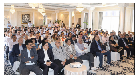
A full house at the meeting